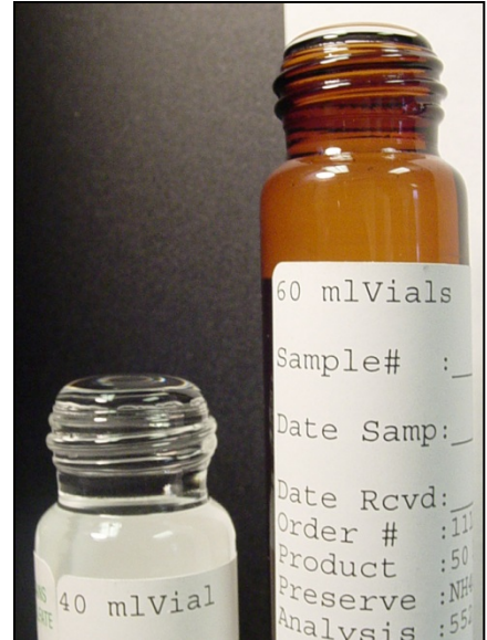
Example of "small button of water"